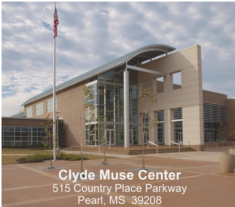
Clyde Muse Center 515 Country Place Parkway Pearl, MS 39208

Wednesday, February 25, 2026 Hinds Community College